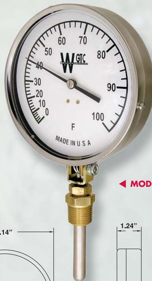
◀ MODEL VA45S